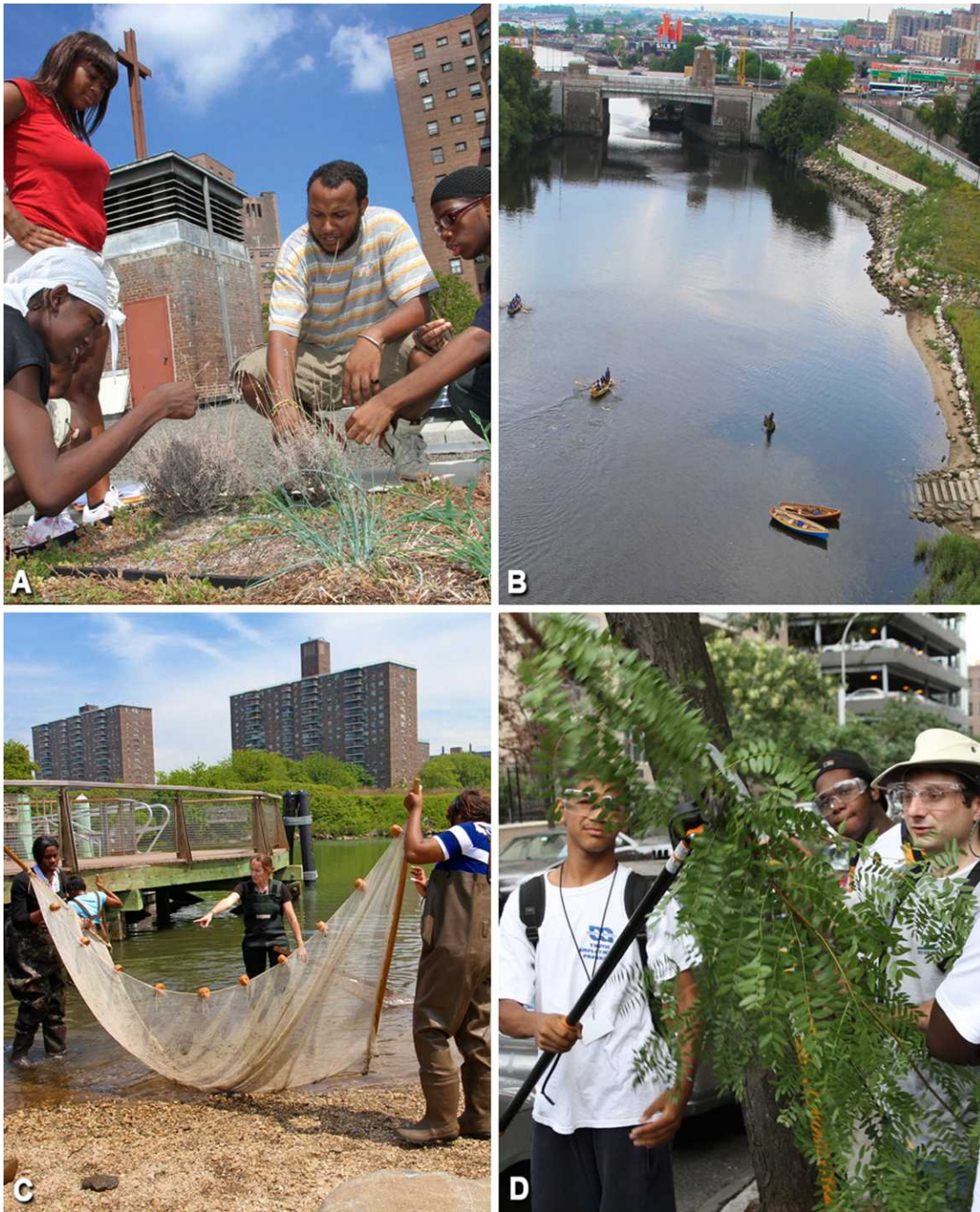
Fig. 2. Examples of urban environmental education activities in the Bronx, New York City, summer 2010: (A) Environmental stewardship on a green roof, Youth Ministries for Peace and Justice, (B) Recreation on the Bronx River, Rocking the Boat, (C) Biodiversity monitoring by students from Satellite Academy High School, (D) Tree pruning workshop conducted by Trees New York for students at Mosholu Preservation Corporation.